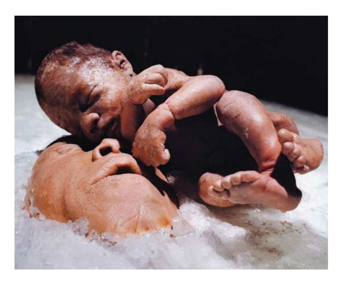
Sun Yuan, Honey (detail), 1999, two cadaver specimens, bed frame, ice.

practices and opening up new artistic directions, curators who attempt to verify the art establishment and authority in their exhibitions, curators who explore in exhibitions their views about art and its place in society, and curators who simply see exhibitions as a prelude for selling art or for building up personal fame.